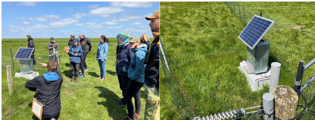
Figure 1 Example: mobile fencing, solar power supply, mesh is conductive, wind can impact stability, chicks can get out/in (+ small predators).