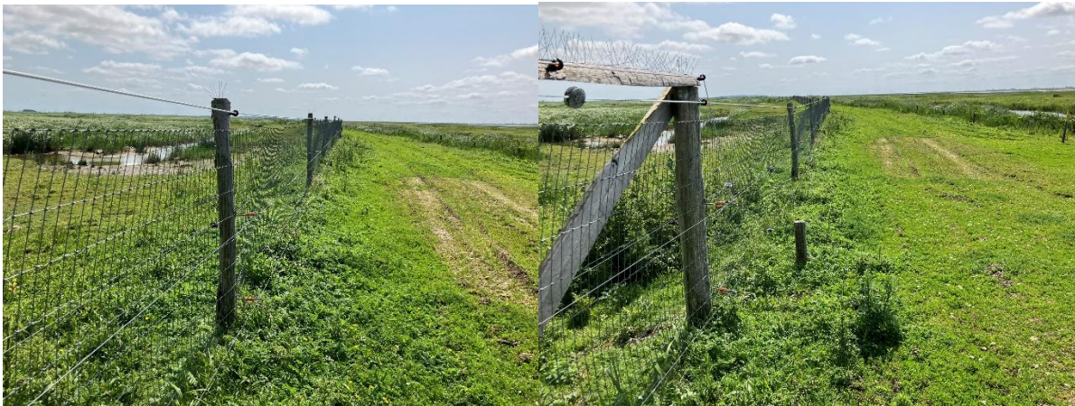
Figure 3: Example, Permanent fence, Mesh UK imported, 5x15 cm, 120 high + 50 cm parallel to ground, additional 3 wires conductive, top wire with improved visibility. Posts has spikes/pins,