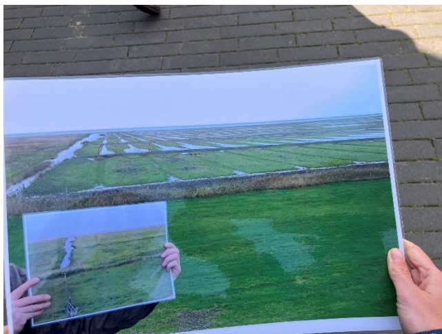
Figure 2 Example, Hydrology before and after improvements. Prerequisite for improved habitat conditions.